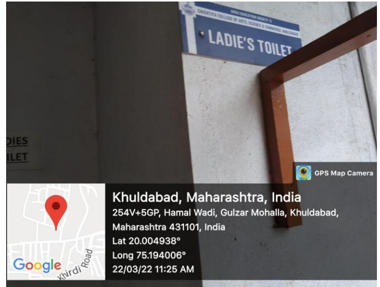
Ladies Wash Room