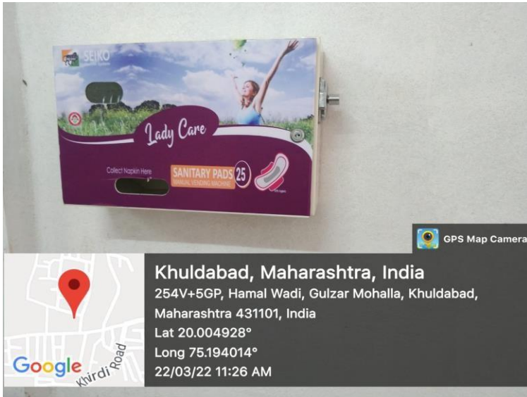
Sanitary Pad Vending Machine